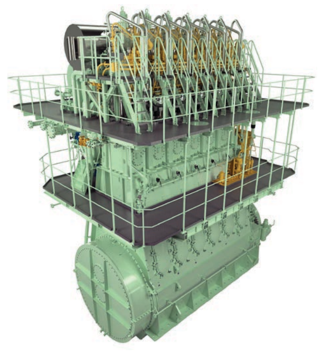
Methanol engine from MAN Energy Solutions

"In all cases [except the forthcoming low-pressure ME-GA dual-fuel LNG engine] our engines use the Diesel process, so the concept of what is needed from the lubricant is similar. For all low-sulphur fuels the recommendations are essentially the same as for 0.10% and <0.50% sulphur fuels."